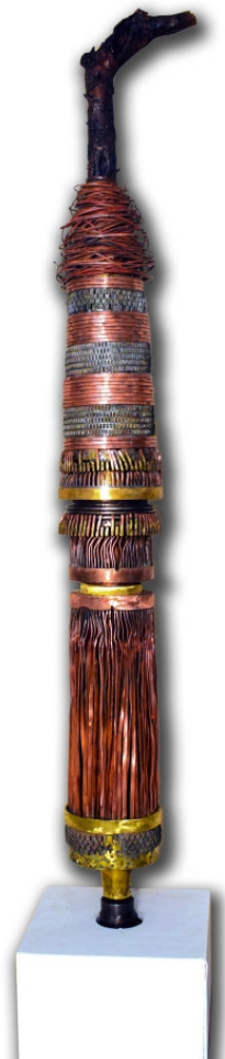
Narayan Sinha Evolution , 2023 Copper & Brass 9.25' H x 1.5' W