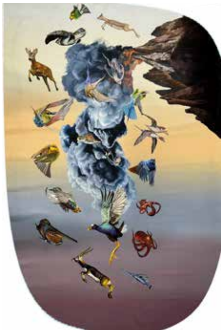
Satadru Sovan, Mountain Cry , Acrylic with Gouache on Canvas 56" x 50", 2023

Satadru Sovan's solo exhibition, Disappearing Echoes of the Isolated , to be held at Kalakriti Art Gallery from 11 July to 7 August, 2025, offers a vivid fusion of ecological and gender-based narratives. Through surreal, chromatically rich landscapes inhabited by extinct species, Sovan reflects on climate collapse and environmental imbalance. His layered compositions combine bold visual language with performance and myth, turning ecological devastation into an immersive visual experience. Simultaneously, the exhibition explores queer identity and gender fluidity, challenging societal norms through the queer gaze and sensual imagery. Sovan's art transcends aesthetics, inviting viewers into a space of critical reflection and emotional engagement. Blending absurdity with urgency, he reimagines art as a site of resistance, transformation and inclusive futures.