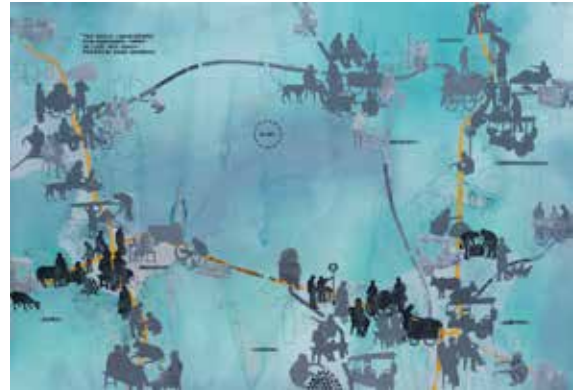
Prasanta Sahu, Mapping My Neighbourhood , Acrylic and photo transfer on acid-free paper, 40 3/4" x 59", 2024

From 25 April to 21 June 2025, Emami Art showcased The Geometry of Ordinary Lives and Re-Figuring , two exhibitions exploring memory, materiality and embodiment. In Gallery 1, Prasanta Sahu's solo exhibition offered a decade-long inquiry into rural and suburban life, where artisanal practices—blacksmithing, carpentry and pottery—served as living archives. Combining object casting, diagrammatic studies and interviews, Sahu employed cartographic logic and poetic sensibility to preserve generational knowledge through a research-driven visual language. In Gallery 2, Re-Figuring brought together recent works by Avishek Das, Bholanath Rudra, Janhavi Khemka, Swastik Pal, Priti Roy, Santanu Debnath, Sayanee Sarkar, Kushan Bhattacharya, Tapas Biswas and Ushnish Mukhopadhyay. Working across painting, video, sculpture, photography and drawing, the artists reimagined the figure as a shifting construct shaped by environment, surveillance and capitalist alienation. The body, no longer static, emerged as a discursive site of resistance, entangled with collapsing ecosystems, spatial politics and collective memory.