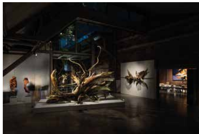
Photograph of the Installation, Iram Art Gallery

traditional formats into sculptural, anatomical studies. Referencing the Florentine Renaissance’s fascination with the human body, the works turn the gallery into a visual arena, where wooden stretcher bars evoke skeletal systems and canvases become metaphorical bodies. Poirier’s curation highlights how Decrauzat’s manipulation of form, surface and perception creates a layered dialogue between physiology and abstraction. A catalogue with an essay by Poirier accompanies the show, on view from 17 May to 4 October 2025.